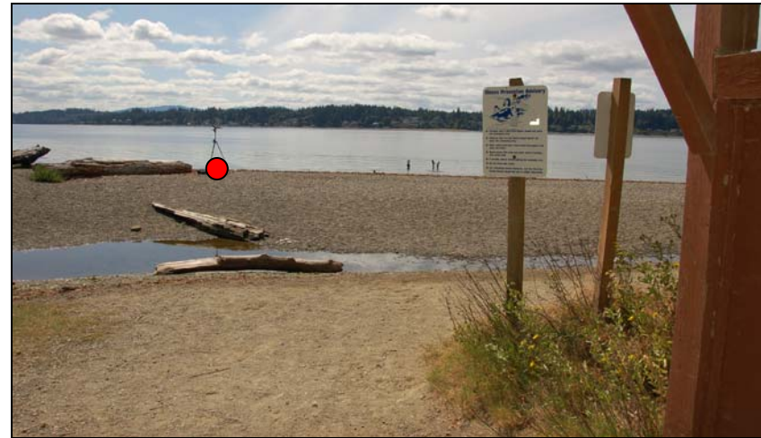
The pilings to left are 255 meters from survey site