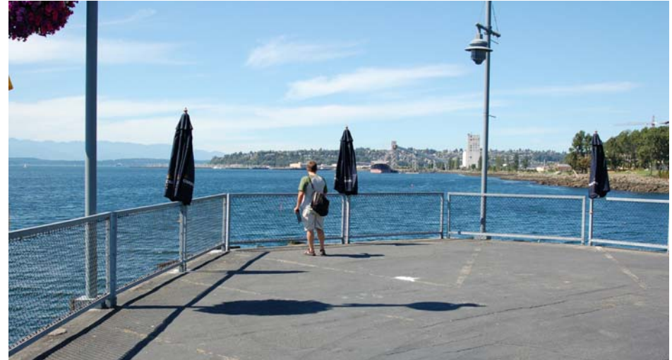
2 nd story balcony of gray building is 275 meters from survey site