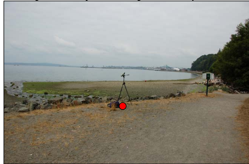
The train overhead signal below is 363 meters from survey site