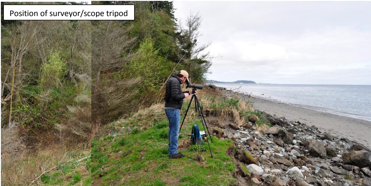
Position of surveyor/scope tripod