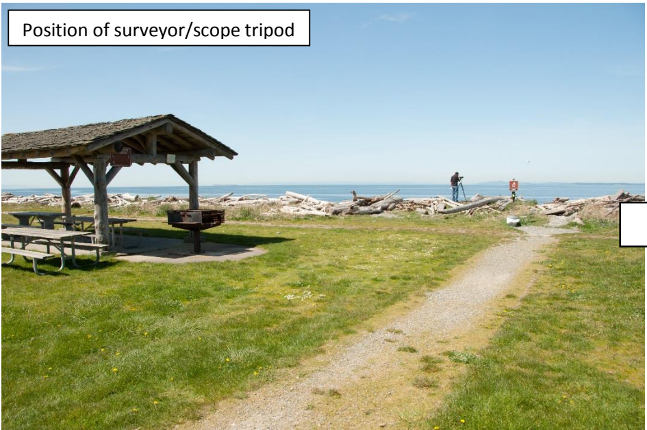
Position of surveyor/scope tripod