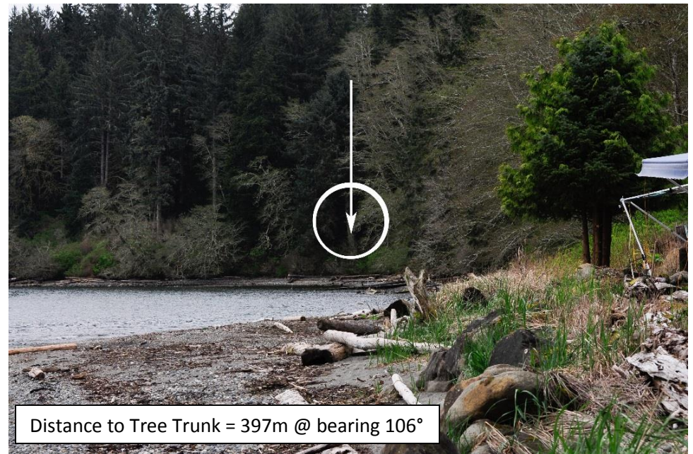
Distance to Tree Trunk = 397m @ bearing 106°