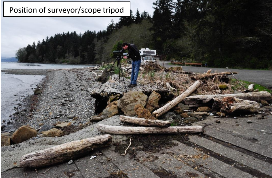
Position of surveyor/scope tripod