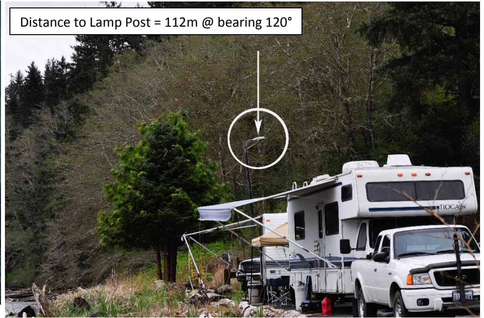
Distance to Lamp Post = 112m @ bearing 120°