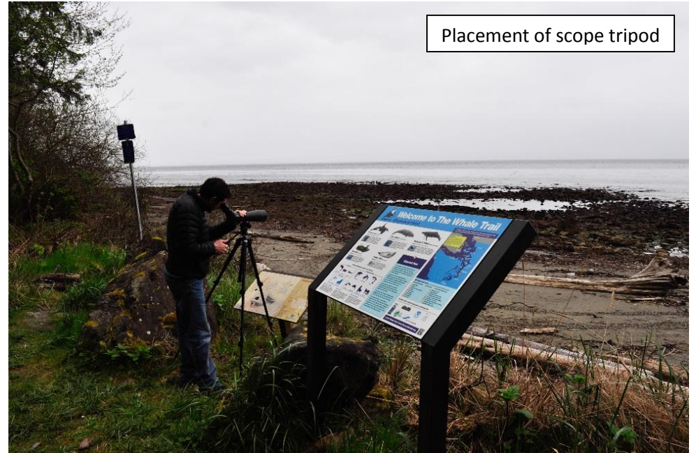
Placement of scope tripod