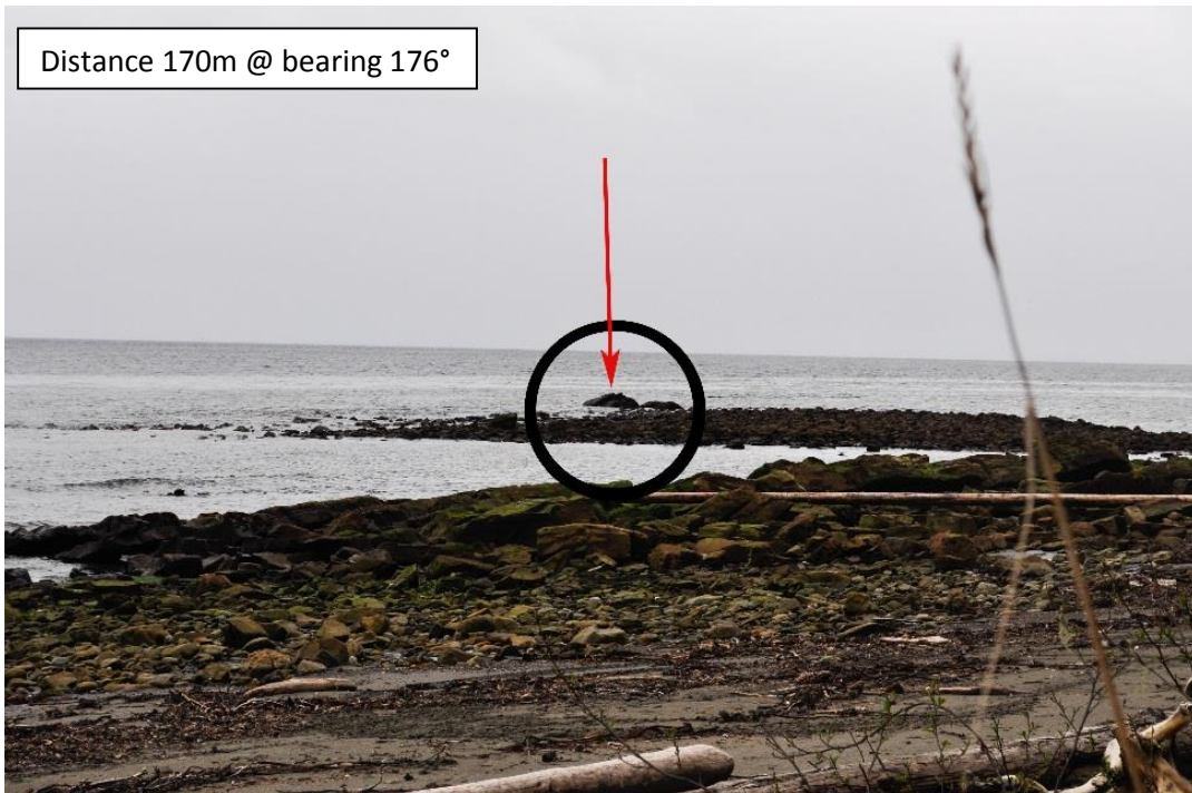
Distance 170m @ bearing 176°