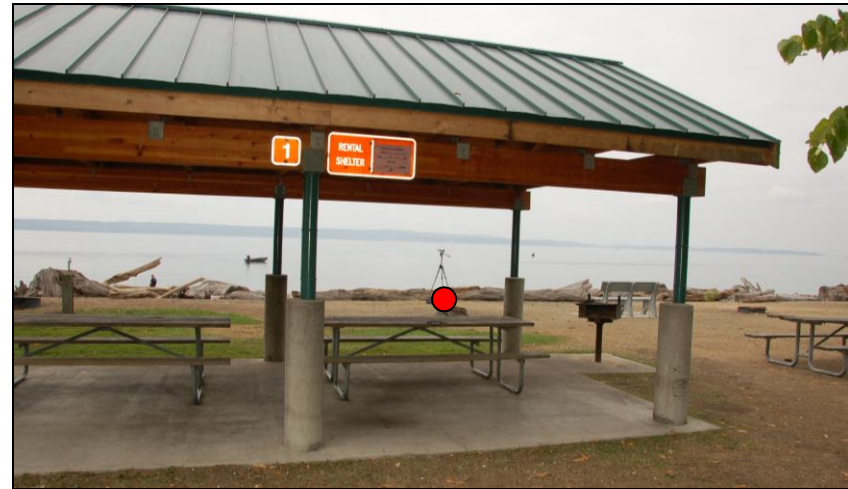
The white buoy to north is 325 meters from survey site